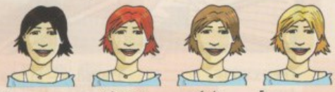
4 ginger fair 5