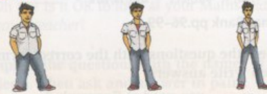
6 average slim